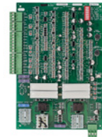
1500 636 Board CBOX 816 arm