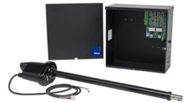
Swing Gate Operator

Nice Group USA is a U.S. leader in low voltage automated gate systems, with solar power options. We offer a wide range of automation systems for swing gates, sliding gates and road barriers for residential, commercial and industrial applications.