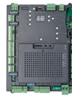
1550 936 Board CBOX 816 arm