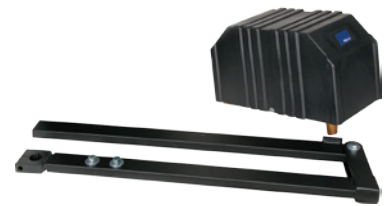
Swing Gate Operator

Nice Group USA is a U.S. leader in low voltage automated gate systems, with solar power options. We offer a wide range of automation systems for swing gates, sliding gates and road barriers for residential, commercial and industrial applications.